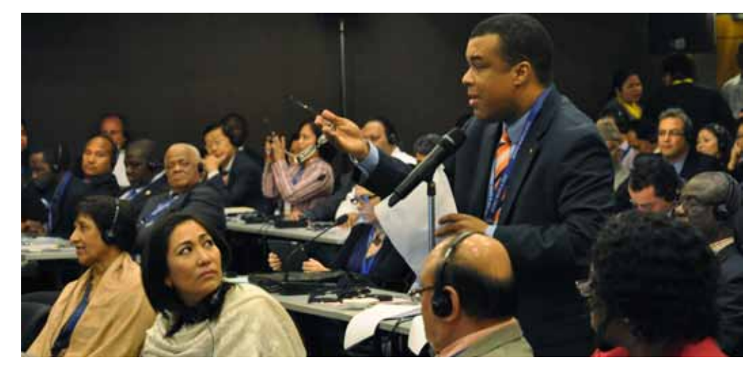
GOPAC members at Participation of Society session during fifth Global Conference of Parliamentarians Against Corruption. Manila, Philippines. 1 February 2013.

The GTF-PoS engages and motivates GOPAC regional and national chapters and parliamentarians through the sharing of experiences and best practices, and by promoting practical tools and techniques for public engagement on anticorruption issues. It helps different parliamentary systems develop suitable legislation to promote transparency, access to information, and protection of civil rights for those who take a stand against corruption.