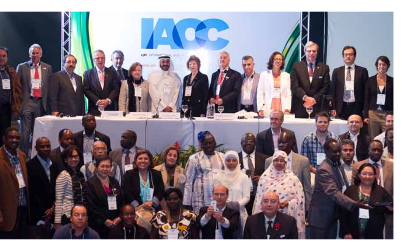
GOPAC panel at the 15th International Anti-Corruption Conference. Brasilia, Brazil. 10 November 2012.

The GTF-PoS engages and motivates GOPAC regional and national chapters and parliamentarians through the sharing of experiences and best practices, and by promoting practical tools and techniques for public engagement on anticorruption issues. It helps different parliamentary systems develop suitable legislation to promote transparency, access to information, and protection of civil rights for those who take a stand against corruption.