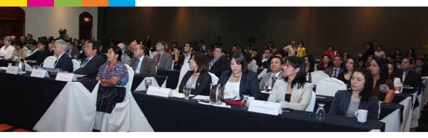
GOPAC Latin America and the Caribbean hosts parliamentary ethics workshop. San Salvador, El Salvador. 23 April 2013.