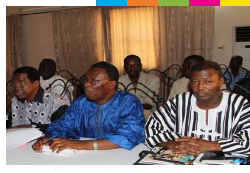
Members of APNAC-Burkina Faso at anti-corruption workshop. 2012.

In June 2011, members of APNAC-Burkina Faso and the Extractive Industries Transparency Initiative in Burkina Faso (EITI-BF), united to fight corruption in the national mining sector. APNAC-Burkina Faso and EITI-BF members pressured leaders in the mining sector to ensure transparency and good governance in