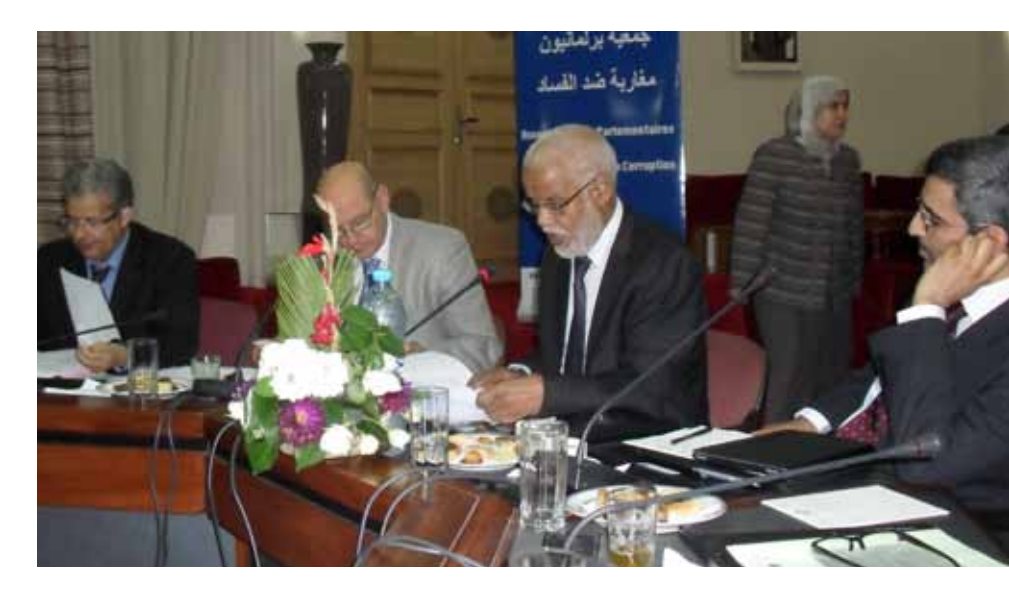
ARPAC Morocco workshop.

Since 2012, ARPAC Morocco has been working to ensure the country's domestic legislation meets the requirements of the United Nations Convention Against Corruption (UNCAC). Using an assessment tool for parliamentarians developed jointly by GOPAC and the United Nations Development Programme, ARPAC Morocco members carried out a review of existing legislation.