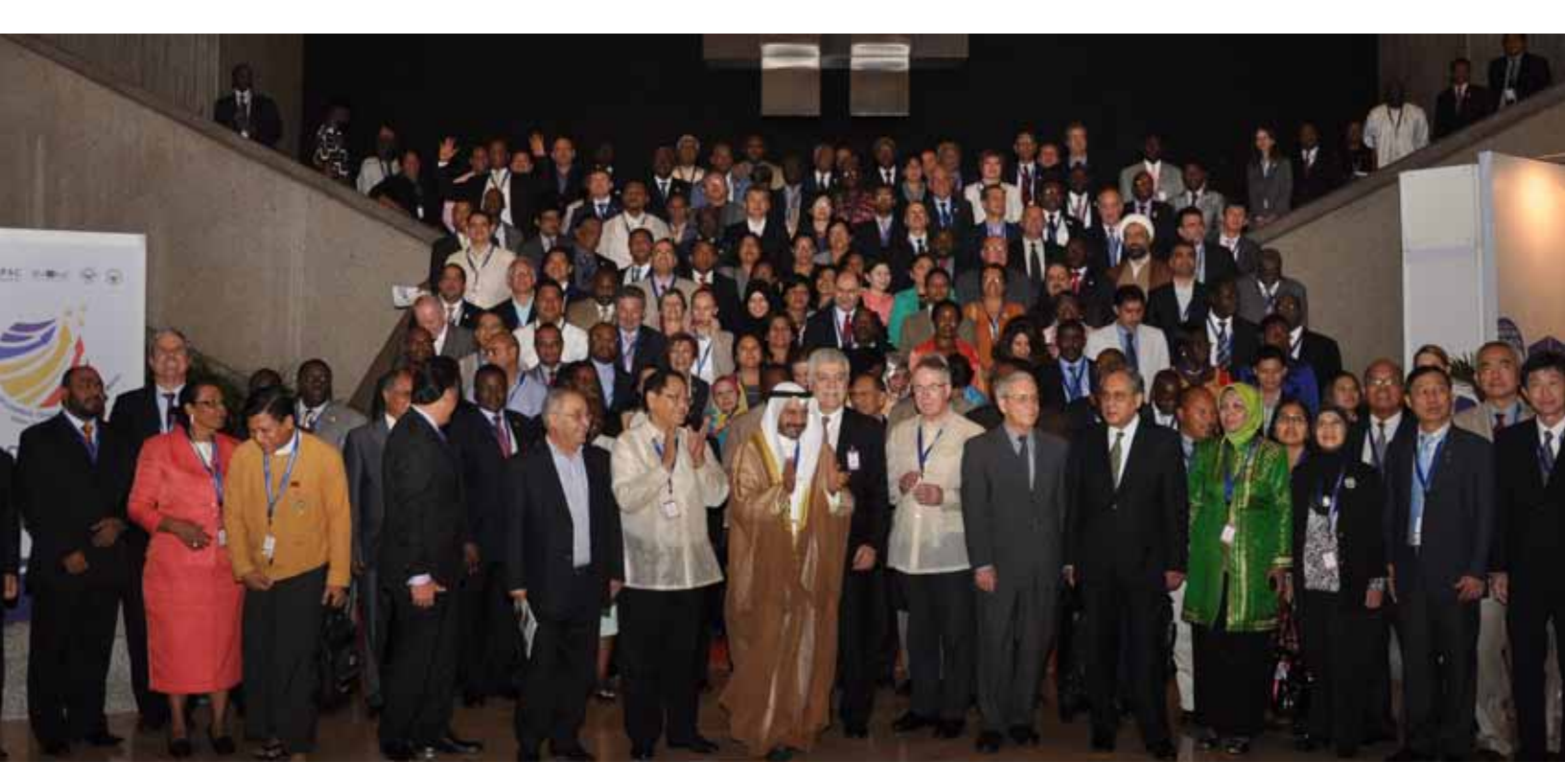
Members of GOPAC gather at close of the fifth Global Conference of Parliamentarians Against Corruption. Manila, Philippines. 2 February 2014.

In addition, we also have the national chapters in areas where we have yet to establish regional chapters: Albania, Azerbaijan, Bangladesh, Canada, Kyrgyzstan, Mongolia, Montenegro, Nepal, Serbia, Sri Lanka, Ukraine, the United Kingdom, and Italy. GOPAC is also currently in the process of developing regional chapters in South Asia and the non-Spanish speaking Caribbean.