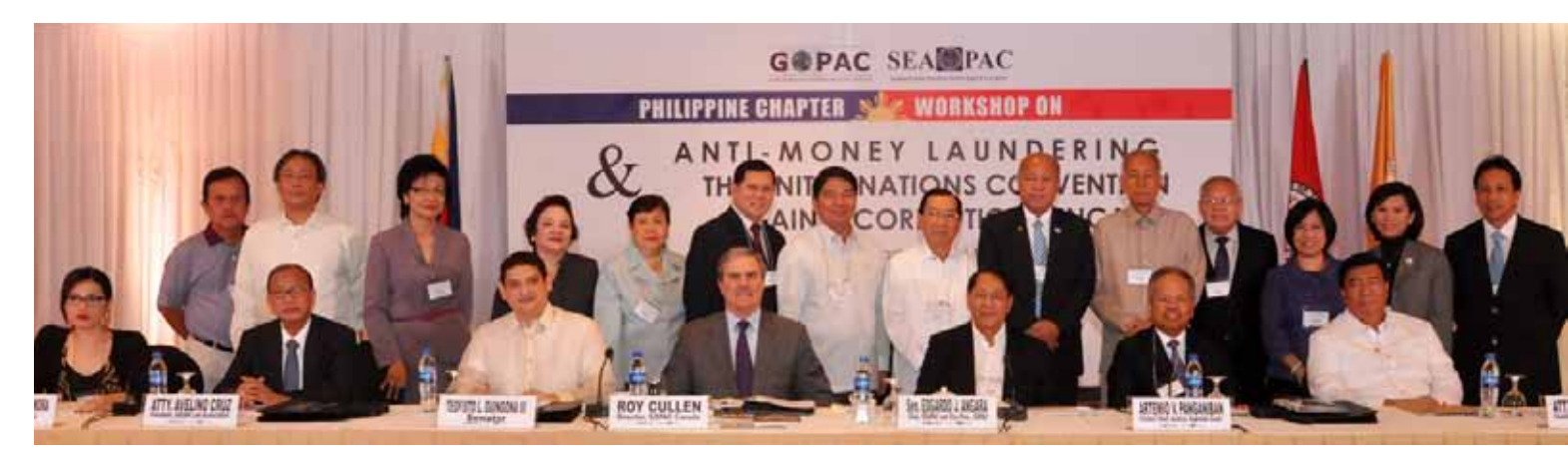
SEAPAC Philippines Anti-Money Laundering Workshop. Manila, Philippines. 16 March 2012.